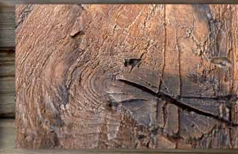
A perfect combination of handcrafted textures, colors and woodgrains replicate every last detail of authentic wood. Large Barn Beam-Brown LBB-78-BRN (AA-11-03321)

These Mantels are meticulously handcrafted using patented, lightweight concrete to replicate the look of reclaimed wood and stone. Industry first, non-combustible mantels are designed to divert heat away from TVs, electronics or artwork that sit above the fireplace so mantels can be installed lower and closer to the fireplace than their real-life counterparts.