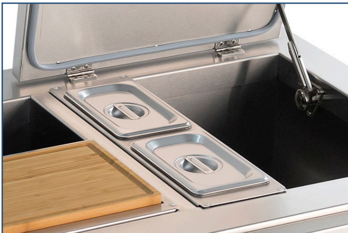
Removable Condiment Trays

When it's time to slice and dice, the Bamboo Cutting Board fits perfectly over the sink.