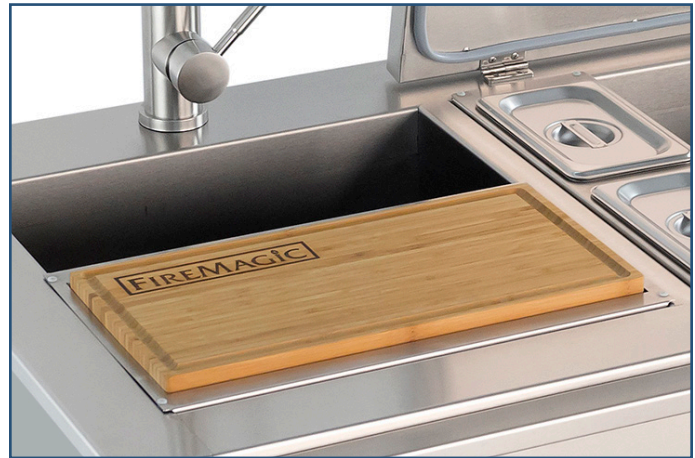
Removable Bamboo Cutting Board

Pull-down Mixer Faucet conveniently brings hot and cold water to your outdoor kitchen.