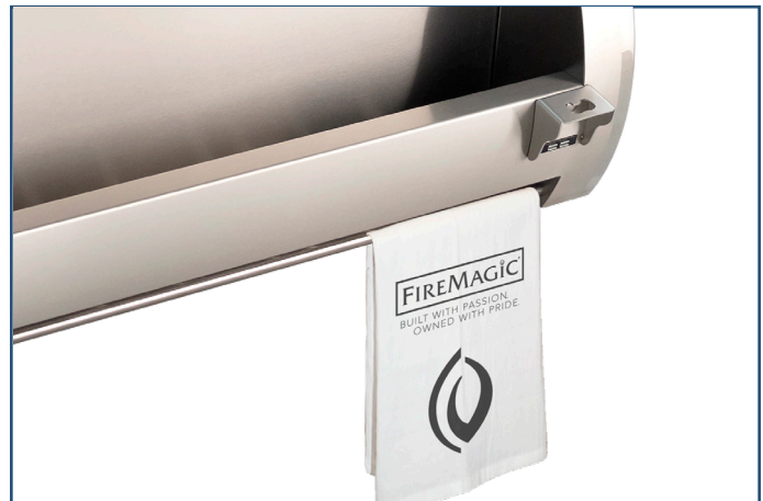
Towel Rack & Bottle Opener

Keep your sliced fruit & veggies cold inside the Removable Condiment Trays that are fitted inside the ice chest side.