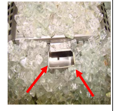
DO NOT COVER VENTS!