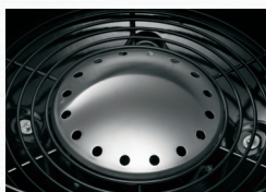
Stainless Steel Heat Diffuser