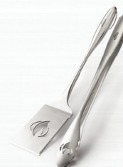
PRO TWO PIECE STAINLESS STEEL TOOLSET #70033