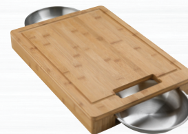
PRO CUTTING BOARD AND BOWL SET #70012