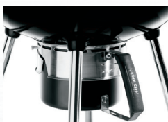
Removable Heavy Steel Ash Catcher with PRO Air Control System