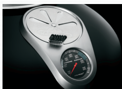
ACCU-PROBE™ Temperature Gauge with Smoke and Sear Range