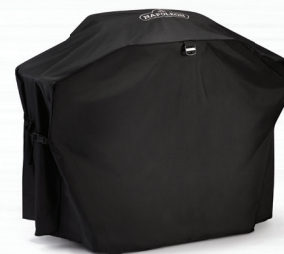
PREMIUM FITTED COVER #61288