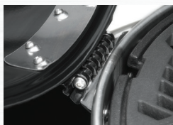
Corner Hinged Lid