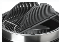
Hinged Cooking Grids with Three Height Adjustments