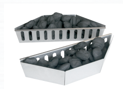
Optional Charcoal Baskets