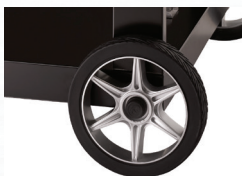
Rugged & Weather Proof Wheels