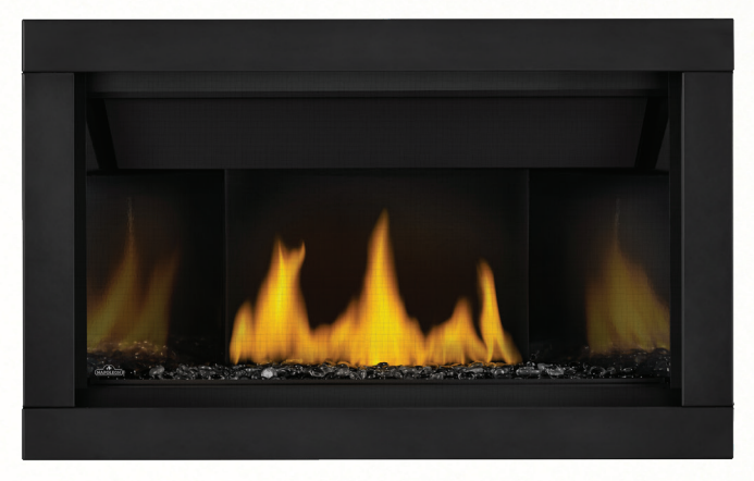
Classic four-sided surround in black shown with Black Glass Beads