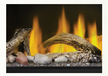
Beach Fire Kit and Shore Fire Kit on Clear Glass Embers