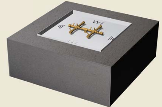
FS4848 - 48" Square Fire Pit Kit shown with the MLS120 burner. Other burner options available.